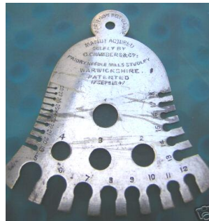
1847 Bell Gauge