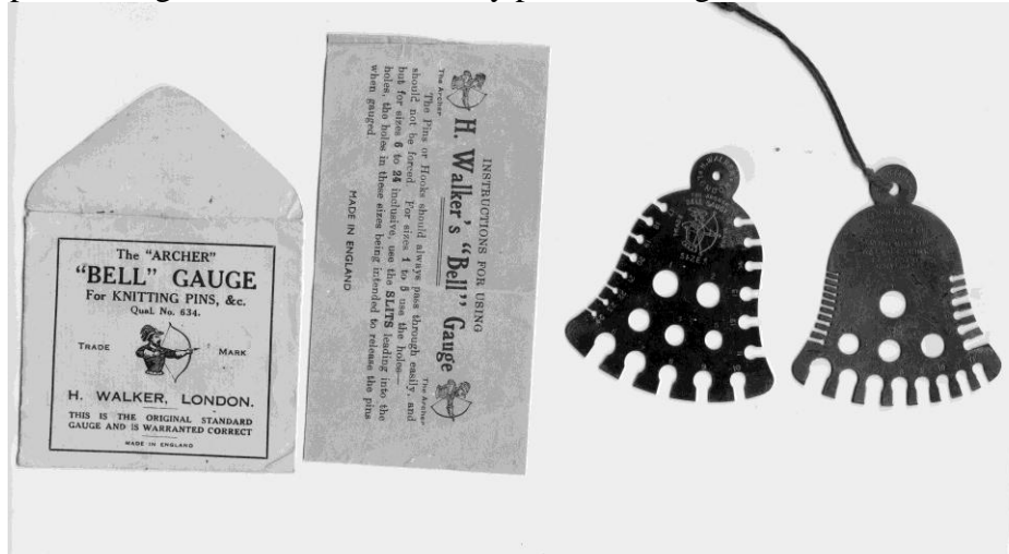
“Archer” Bell gauge

similarities, but also many differences. The key to deciding which needle to use, if not specified, again seems to be to study patterns and garments for clues.