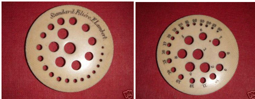
Lambert Gauge (Front – L; Back – R)