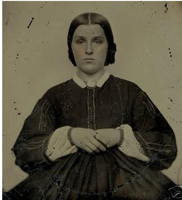
Knitted undersleeves

“Knitting has been called the friend of the blind, and is certainly the friend of the aged, as it affords the most easy and graceful employment in which they can be engaged. Then it is a really useful art both for the rich and poor...knitting can be done at times when no other work could be taken up, and during the long winter evenings what a host of useful things can be thus made by the industrious fingers! Caps, cuff, comforters, shawls, spencers, stockings, tippets, gloves, mitten. And then what stores of ornamental articles does it afford! What beautiful purses, bags, and beadwork will knitting produce?— Godey’s Magazine and Lady’s Book , Feb. 1847